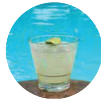
Tommy's 160K Rooster Rojo Reposado, Lime, Agave Syrup