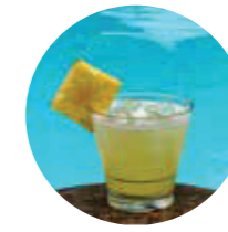
Pineapple 160K Rooster Rojo Smoke Pineapple, Fresh Pineapple, Lime, Agave Syrup