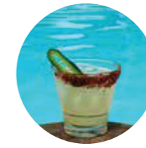
Spicy 160K Rooster Rojo Blanco, Jalapeño, Lime, Agave Syrup