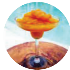
Mango Daiquiri Bacardi Rum, Mango Purée, Fresh Lime 160K