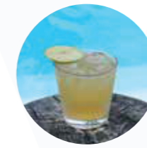
Belini Margarita 170K Rooster Rojo Reposado, Orange Juice, Lime Juice, Peach, Sparkling Wine Lime, Agave Syrup