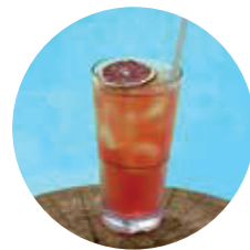
Aperol Long Island Aperol, Gin, Rum, Vodka, Tequila, Citrus, Red Bull Energy Drink 160K