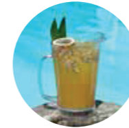
Passionfruit Punch Bacardi Spiced Rum, Cinnamon, Passionfruit, Pineapple, Peach Syrup, Lime, Coconut Water 600K