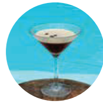
Coffee 170K 1800 Coconut, Triple Sec, Espresso, Coconut Syrup