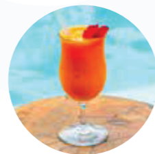
Sippy Frosé Rosé Wine, Peach Liqueur, Lemon, Mango Juice 160K