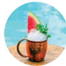
Water Melon Mule East Indies Gin, Watermelon, Mint, Spiced Citrus, House Ginger Beer 150K