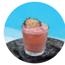
Aperol Margarita 170K Rooster Rojo Smoked Pineapple, Aperol, Coconut Cream Lime, Coconut Syrup