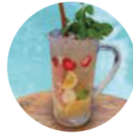
Sangria Red or White Wine with Tropical Fruit Slices 600K