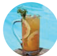
Sippy Spritz East Indies Gin, Limoncello, Blood Orange Tonic, Lemon & Pomelo 600K