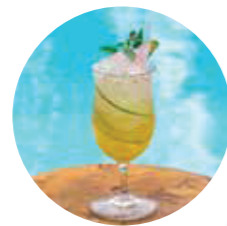
Cucumber Fizz Gin, Cucumber, Spice Citrus, Kemangi, Sugarcane Fizz 150K