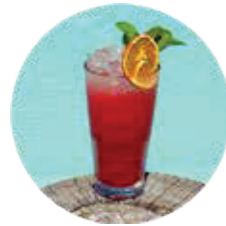
El Chapo East Indies Gin, Aperol, Strawberry, Lime Juice, Soda 150K