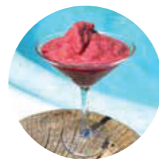
Berry Breeze Bacardi Rum, Southern Comfort, Vanilla, Citrus, Berry Mix 160K