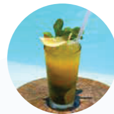
Coco Mango Bacardi Spiced Rum, Mint, Lime, Mango, Fresh Coconut Water 150K