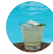
Coconut 170K 1800 Coconut, Triple Sec, Lime, Vanilla Syrup