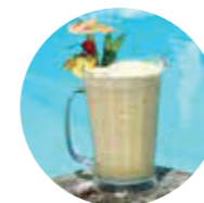
Pina Colada Coconut Infused Rum, Fresh Pineapple, Coconut Purée 600K