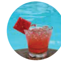
Watermelon 160K Rooster Rojo Blanco, Aperol, Watermelon, Red Chili, Lime, Agave Syrup