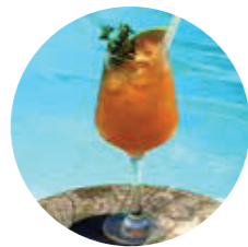
Sippy Spritz East Indies Gin, Limoncello, Blood Orange Tonic, Lemon & Pomelo 150K