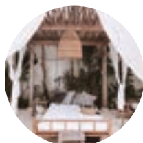
Cabana (maximum 4 pax) IDR 2.5 million minimum spend