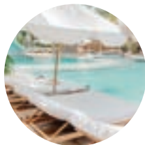
Single Daybed (1 pax) IDR 500,000 minimum spend

We recommend booking a daybed especially for the busier days (Thursday to Sunday):