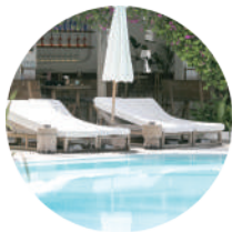
Single Daybed (1 pax) IDR 1,000,000 minimum spend

We recommend booking a daybed especially for the busier days (Thursday to Sunday):