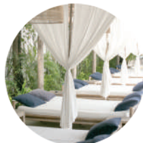
Cabana (maximum 4 pax) IDR 2.5 million minimum spend

- On special event days, these prices may vary.