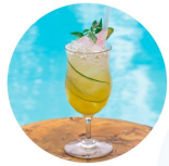
Cucumber Fizz Gin, Cucumber, Spice Citrus, Kemangi, Sugarcane Fizz 140K