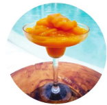
Mango Daiquiri Bacardi Rum, Mango Purée, Fresh Lime 150K