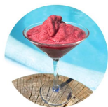
Berry Breeze Bacardi Rum, Southern Comfort, Vanilla, Citrus, Berry Mix 150K