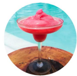
Strawberry Margarita Tequila Reposado, Triple Sec, Lime, Strawberry Purée 150K