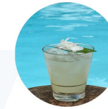
Coconut 1800 Coconut, Triple Sec, Lime, Vanilla Syrup 160K