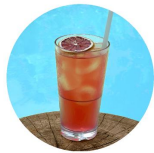
Aperol Long Island Aperol, Gin, Rum, Vodka, Tequila, Citrus, Red Bull Energy Drink 150K