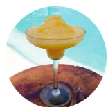
Passion Fruit Margarita Tequila Reposado, Triple Sec, Vanilla, Lime, Passion Fruit Purée 150K