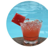
Watermelon Tequila Blanco, Aperol, Watermelon, Red Chili, Lime, Agave Syrup 150K