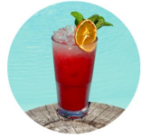
El Chapo East Indies Gin, Aperol, Strawberry, Lime Juice, Soda 140K