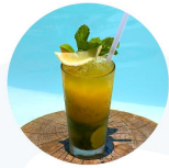
Coco Mango Bacardi Spiced Rum, Mint, Lime, Mango, Fresh Coconut Water 140K