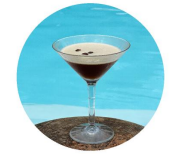
Coffee 1800 Coconut, Triple Sec, Espresso, Coconut Syrup 160K