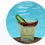
Spicy Jalapeño Tequila Blanco, Selaka Ning, Jalapeño, Kemangi, Lime, Agave Syrup 150K