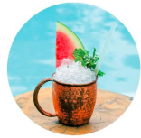
Water Melon Mule Skyy Vodka, Watermelon, Mint, Spiced Citrus, House Ginger Beer 140K