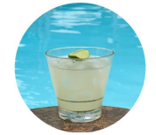
Tommy's Tequila Blanco, Lime, Agave Syrup 150K