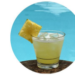
Pineapple Tequila Blanco, Fresh Pineapple, Lime, Agave Syrup 150K