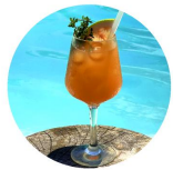
Sippy Spritz Skyy Vodka, Limoncello, Blood Orange Tonic, Lemon & Pomelo 140K